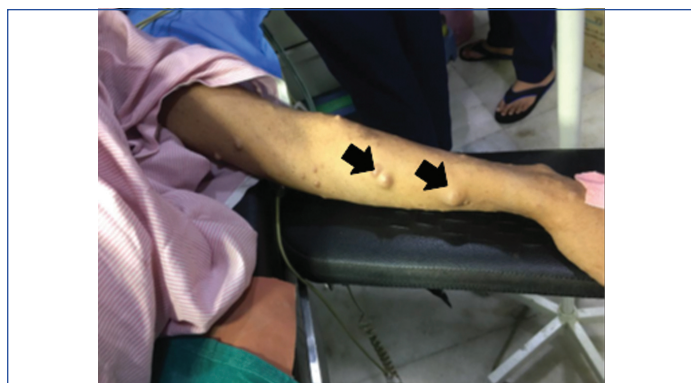
[Table/Fig-1]: Café-au-lait spots and neurofibroma on arm.

A 27-year-old primigravida, measuring 154 cm in height and weighing 68 kg, presented at 37 weeks' gestation for an emergency Lower Segment Cesarean Section (LSCS). The patient had been diagnosed with NF1 approximately 10 years earlier, based on the presence of multiple café-au-lait spots and cutaneous neurofibromas [Table/Fig-1]. The patient also presented with characteristic neurofibromas on the face [Table/Fig-2].